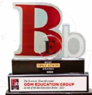
Best Education Brand Award by ET