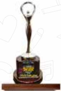
Times Business Awards Odisha 2022 Bhubaneswar Best School of Odisha (ODM Public School)