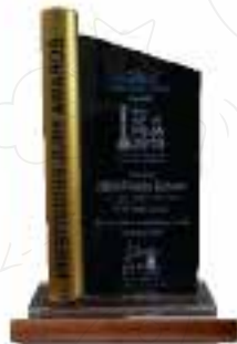
JURY Awards India's Top 50 PSJA, 2019 Tech-School of the Year