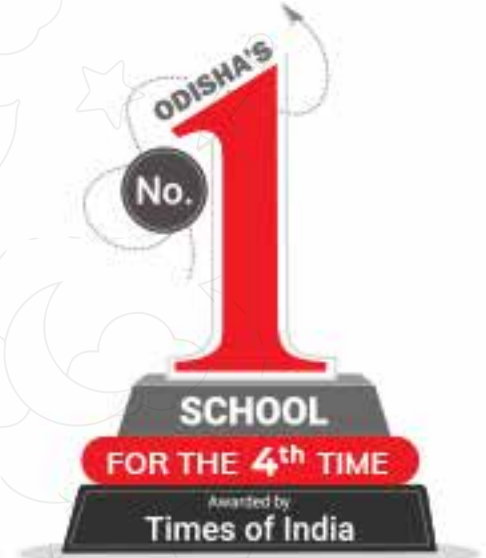
Times School Ranking Survey Odisha 2023